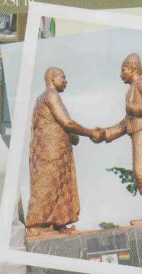
Statue donated to the Ghanaian people by the Lebanese community

Previously, you are the leader of the World Lebanese Cultural Association in Ghana; could you please tell us a about the Association, what it stands for and the activities in Ghana?