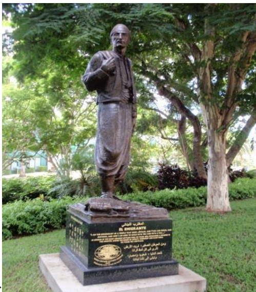
El-Emigrante Libanes (The Lebanese Emigrant) 2010 Brisbane, Queensland, AUSTRALIA

THE ARTIST, Ramiz Barquet: A Mexican national of Lebanese decent, Ramiz is the creator of several monumental sculptures on permanent public display in Puerto Vallarta and worldwide