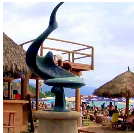
Tiburón en Espiral (Shark Spiral) 1996 Puerto Vallarta, MEX