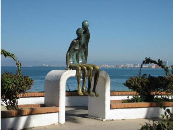
La Nostalgia (Nostalgia) 1984 Puerto Vallarta, MEX