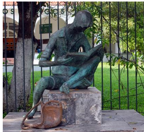
Un Niño, Un Libro, Un Futuro (A Boy, A Book, A Future) 2000 Puerto Vallarta, MEX