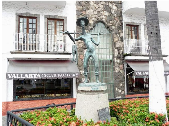
El Pescador (The Fisherman) 1996 Puerto Vallarta, MEX