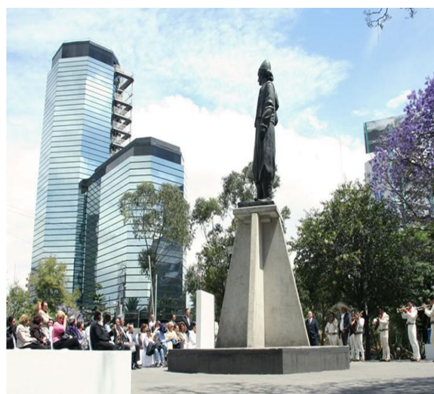
El-Emigrante Libanes (The Lebanese Emigrant) 1979 Mexico City, MEXICO