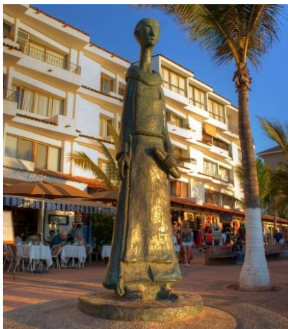
San Pascual Bailón (Patron Saint of Cooks) 2008 Puerto Vallarta, MEX